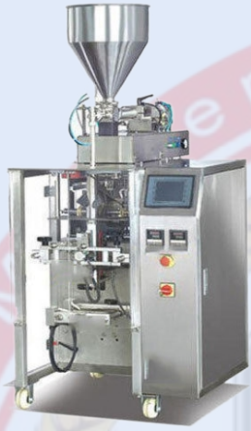
Pouch Packing Machine