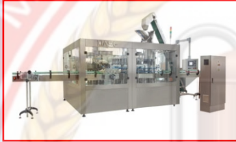
BOTTLE FILLING MACHINE