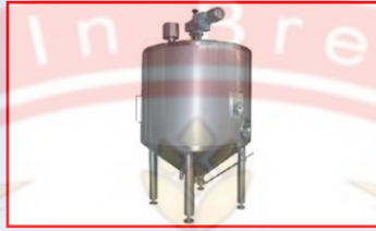
HEAT JACKETED TANK