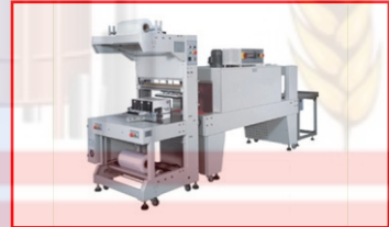
SHRINK PACKING MACHINE