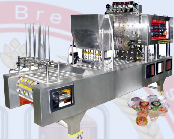
Cup Filling & Sealing Machine