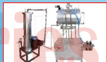
SODA FILLING UNIT